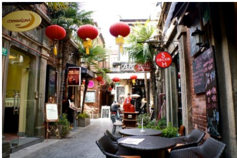
Tian Zi Fang

Head to Xin Tian Di , an outdoor mall development which incorporates traditional stone buildings ( Shikumen ) and a modern shopping centre. The exterior portrays the Shikumen housing of Old Shanghai, while the interior embodies a totally different world of international gallery, bars and cafe boutiques or theme restaurants, a great contrast.