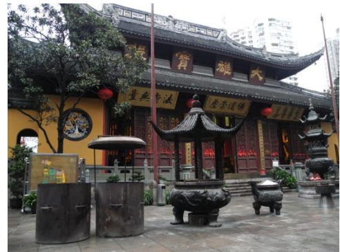
Jade Buddha Temple

Continue to the western part of Shanghai with a venerable and famous religious building; the Jade Buddha Temple . See the two precious jade Buddhist statues; not only rare cultural relics, but also porcelain artworks, both carved from a single piece of white jade which was brought to China from Burma in the late 19 th century.